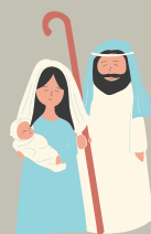
Mary & Joseph: