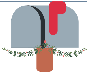
a decorated mailbox